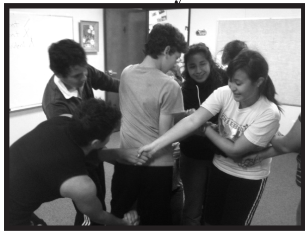
Students participate in new "180*" activity.