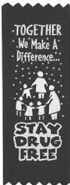
PPAS will honor Red Ribbon Week Oct. 24-28

Red Ribbon Week is the oldest drug-free campaign celebrated in the United States by hundreds of schools all across the country in memory of agent Enrique Camarena, who died while trying to protect his country (USA) from drug dealers. During this week, students are able to relax a little bit by wearing "crazy socks", caps, jerseys and red t-shirts to show their support towards this very important cause. "Red Ribbon Week is one of my favorite weeks of the year. I really enjoy wearing different types of clothes