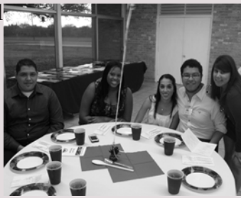
PPAS Alumni at dinner Sat. Oct. 15